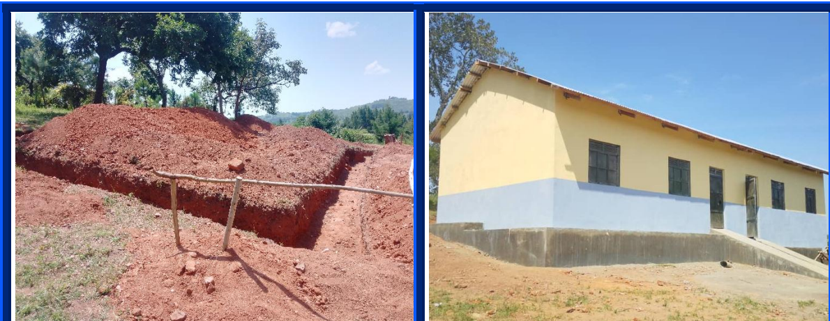
A two-classroom block was constructed at Pei Primary School in 2025 under the AKS II Project in Warr Sub-County, Zombo District. The construction was supported by the project, with significant contributions from parents and the local community, including provision of burnt bricks, sand, aggregates, hardcore, and unskilled labor.