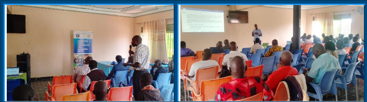
Participants from the West Nile Sub-region, representing Nebbi, Pakwach, Zombo, Yumbe, and Maracha Districts, during the regional reflection meeting held at Happy Hotel in Nebbi Municipality.