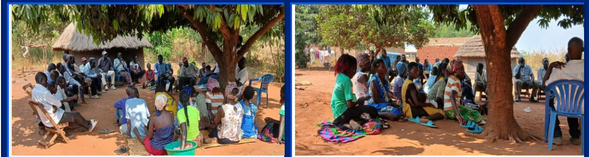
From left to right; community members of Ragem reserve listening to presentation of research findings.