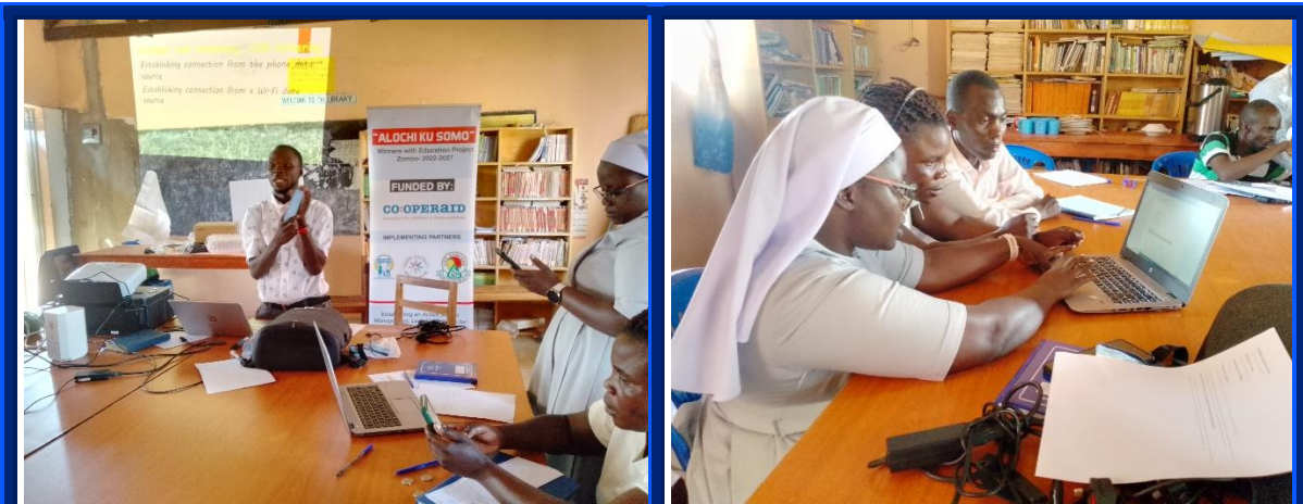
Left: The facilitator demonstrates how to use a smartphone and internet for educational research. Right: Teachers at Agjermach Primary School actively engage in online research using their laptops.