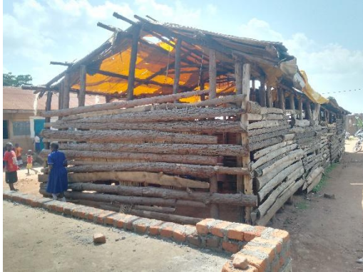
Figure 1: Wooden temporary structure pupils were using before.

For many years, teaching and learning at Mvule Non-Formal Education (NFE) School in Paidha Town Council, Zombo District were marked by significant challenges. The school relied on old, temporary wooden structures that were overcrowded and inadequate for effective learning. Lessons were often conducted in congested spaces, with pupils sharing desks or sitting on the floor. Despite the dedication of teachers, the poor learning environment severely constrained both teaching effectiveness and pupil concentration.