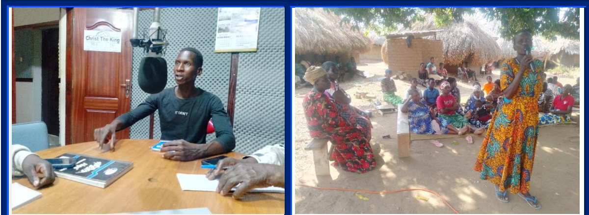
Left: A community activist from Acwera Forest Reserve raises management concerns during the talk show at Christ the King. Right: A female representative of the community deliberating on an issue during community sensitization meetings at Omyer.