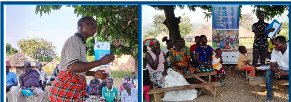
Community representatives from Topowa groups in Kucwiny and Nebbi Sub-counties presenting their issues during the respective Topowa conversation meetings.