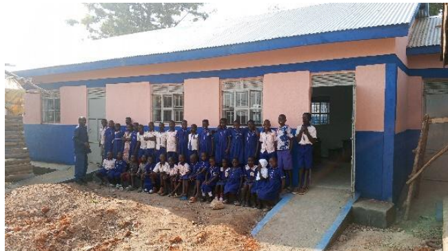
Figure 2: Newly constructed 2 classroom block with project and parent support.

Through the project's provision of industrial construction materials and skilled labour, coupled with strong community participation in supplying local materials and unskilled labour, two permanent classroom blocks and an attached head teacher's office were successfully constructed. The construction process generated excitement and pride among pupils, teachers, and community members alike.